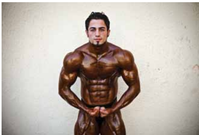
FRAGILE MONSTERS: ARAB BODY BUILDING, 2009.

For all events at the Bluecoat see the events calendar on p.22 - 23