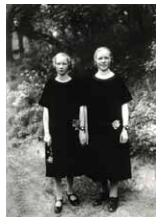
SANDER, PEASANT GIRLS (WESTERWALD, 1927), 1941.

Events: Exhibition Tour: I exist (in some way), 19 May (p.22) Saturday Exhibition Tour: Sara-Jayne Parsons, 8 June (p.23)